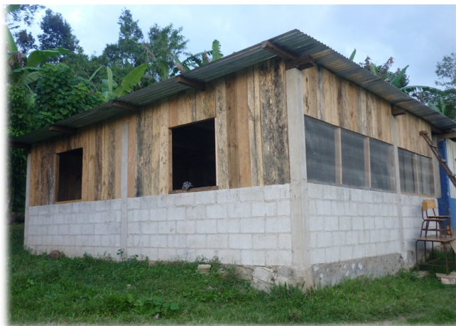
Primary school at El Esfuerzo

EDUCATION: THE FOUNDATION OF HUMAN DEVELOPMENT